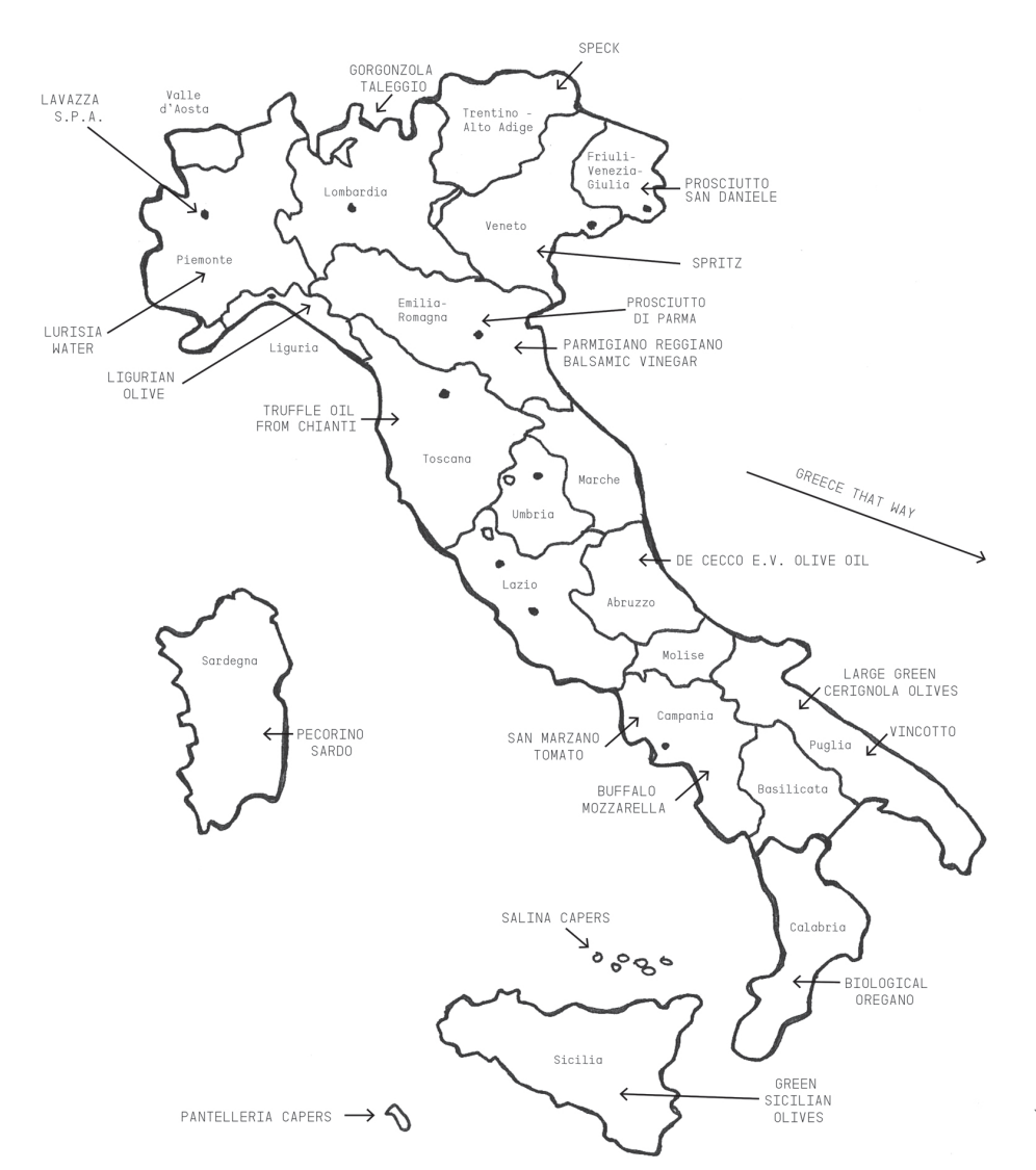
D.O.C.: A phrase used by various agricultural government bodies that set and oversee the standards of some Italian foods, most significantly cheese and wine.

D.O.P.: A mark awarded by the EU and stands for Denominazione di Origine Protetta (Protected Designation of Origin). It is a brand of legal protection - usually by law - to those foods whose peculiar characteristics depend mainly or exclusively from the territory in which they are produced.