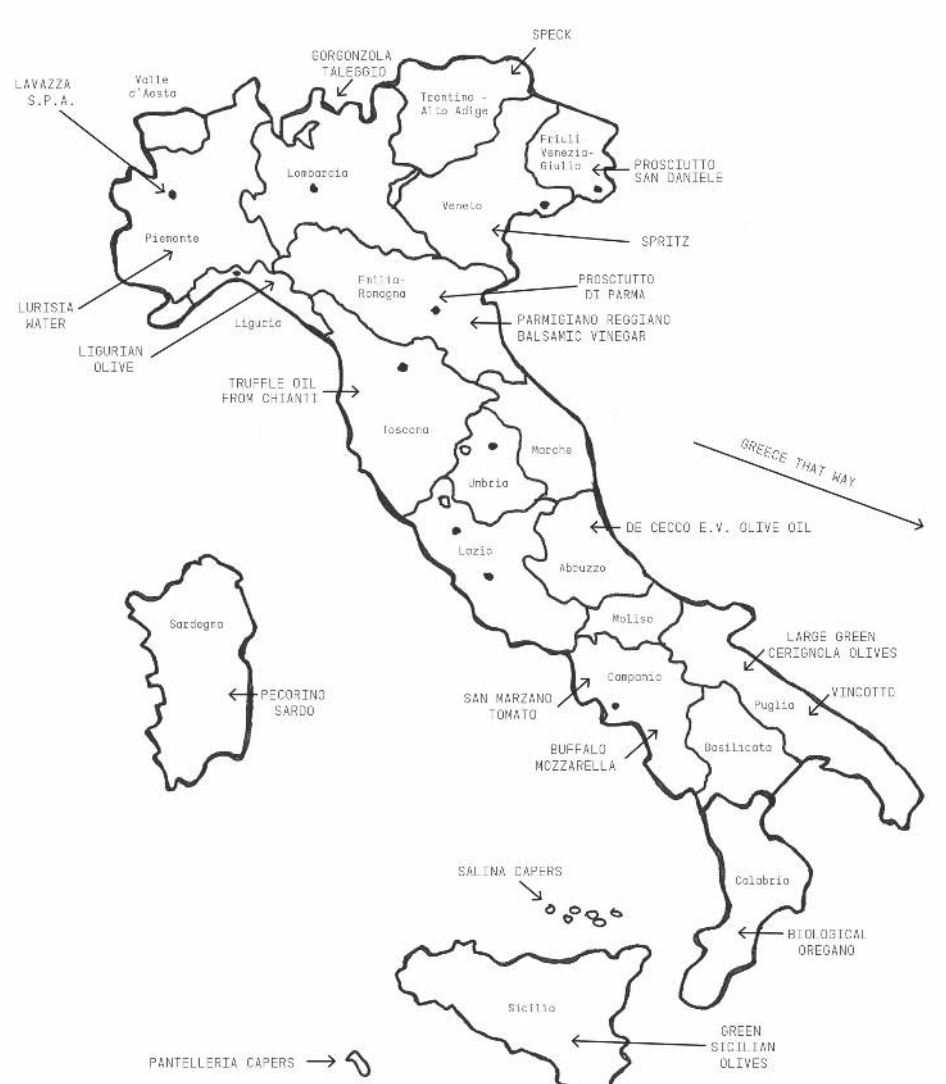
D.O.C.: A phrase used by various agricultural government bodies that set and oversee the standards of some Italian foods, most significantly cheese and wine.

D.O.P.: A mark awarded by the EU and stands for Denominazione di Origine Protetta (Protected Designation of Origin). It is a brand of legal protection - usually by law - to those foods whose peculiar characteristics depend mainly or exclusively from the territory in which they are produced.